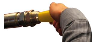
3. Push & Twist